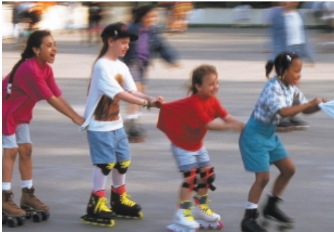
Children active outdoors can be sensitive to some air pollutants.

Air quality is measured by networks of monitors that record the concentrations of the major pollutants at more than a thousand locations across the country each day. These raw measurements are then converted into AQI values using standard formulas developed by EPA. An AQI value is calculated for each of the individual pollutants in an area (ground-level ozone, particulate matter, carbon monoxide, sulfur dioxide, and nitrogen dioxide). Finally, the highest of the AQI values for the individual pollutants becomes the AQI value for that day. For example, if on July 12 a certain area had AQI values of 90 for ozone and 88 for sulfur dioxide, the AQI value would be 90 for the pollutant ozone on that day.