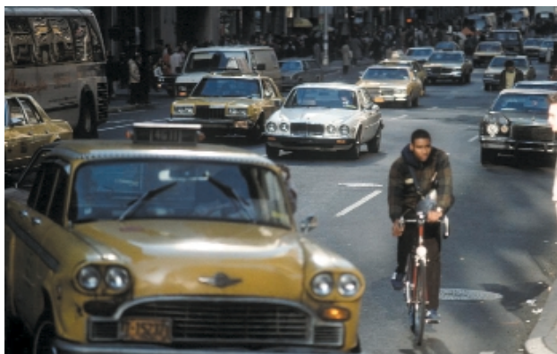
Vehicle exhaust contributes roughly 60 percent of all carbon monoxide emissions nationwide.