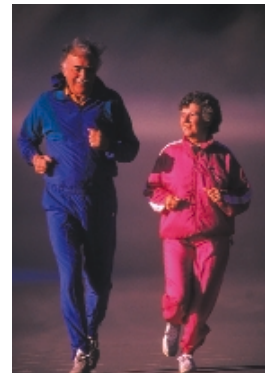
Air quality directly affects our quality of life.

This booklet tells you about the AQI and how it is used to provide air quality information. It also tells you about the possible health effects of major air pollutants at various levels and suggests actions you can take to protect your health when pollutants in your area reach unhealthy concentrations.